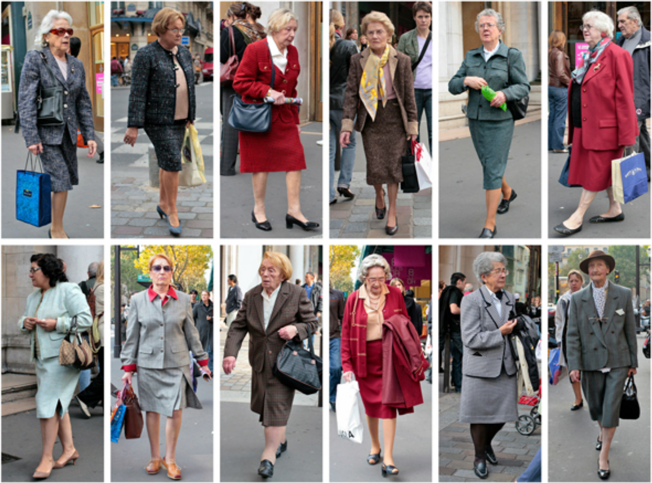
Hans Eijkelboom, Par 79 October 16, 2006 Boulevard Haussmann, from the series Paris, 2007

The Boas photographs are also emblematic of an exhibition that draws on photography both for its record-keeping, archival function, and for its malleability. As a medium, photography is uniquely fit to capture the process of long term artistic pursuits, such as Hans Eijkelboom's dizzily repetitive, typological photographs of street fashion from the 1970s until today, which double as a ruminative and sustained critique of global capitalism. Eijkelboom's Photo Notes 1992–2017, on view in Kassel's Stadtmuseum , brings direct, almost overwhelming evidence of his project into the exhibition space. But at Documenta, other such labor-intensive projects often, by necessity, happen far outside of the museums or galleries where people otherwise encounter them, learn about how they transpired, and consider what they mean, and so the work enters those places as small pieces of a much larger puzzle.