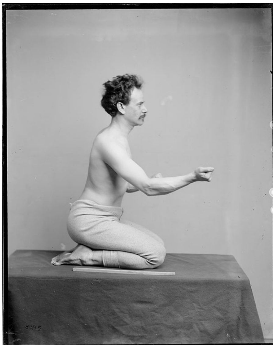
Franz Boas posing for a figure in “Hamatsa Coming Out of Secret Room,” 1895

Some of the most provocative images in the latest edition of the quinquennial exhibition Documenta, first presented this spring and summer in Athens, show a man kneeling on top of a table with a hoop and a stick in his hands. He wears a moustache, has scars on his face, and his torso is bare. In a series of twelve black-and-white photographs, which until last month were all squished into a tight spot on an upper floor of EMST, the National Museum of Contemporary Art in Athens, he strikes various poses animated by anger, bemusement, and agony. The figure in the photographs could be an avant-garde artist—male, of course—experimenting with modes of conceptual performance and minimalist sculpture in the makeshift lofts and factory spaces of downtown New York in the early 1970s. In fact, he is the revolutionary anthropologist Franz Boas, mentor of everyone from Margaret Mead to Claude Lévi-Strauss, and famed for the ethical foundations he laid for the field. Though still underappreciated, Boas was also crucial for his tireless disputations against eugenics and other bogus theories of racial superiority, which, in the first half of the twentieth century, bent scientific findings to fascist doctrines.