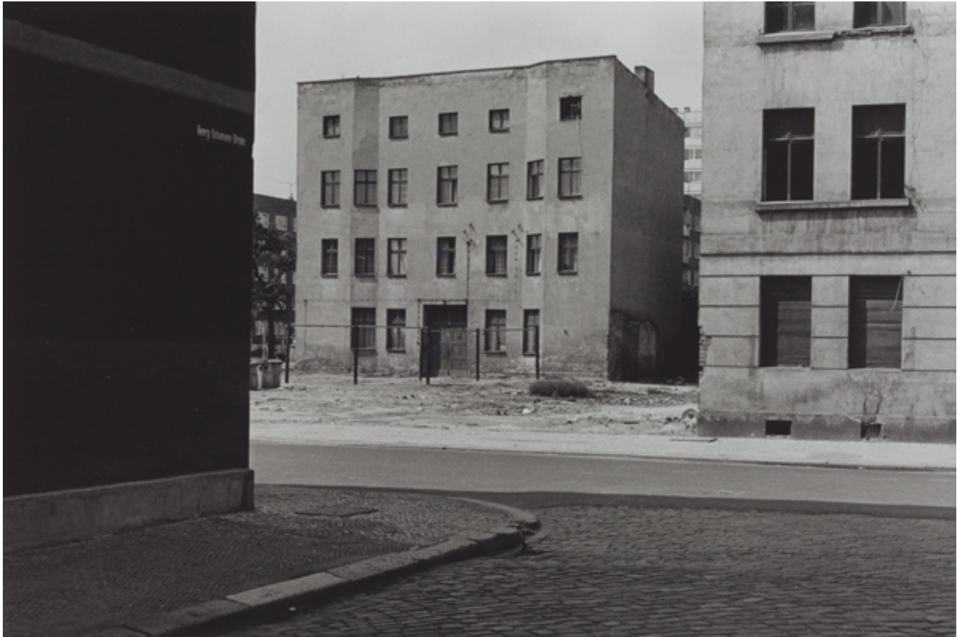
Ulrich Wüst, from Stadtbilder (Cityscape) , 1980–83