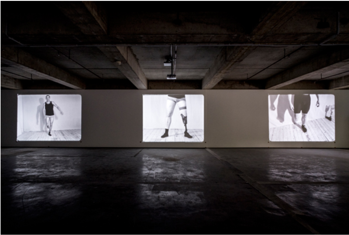
Artur Żmijewski, Realism , 2017. Six-channel video. Installation view at Documenta 14, Kassel

Żmijewski's films capture the essence of Documenta 14, and epitomize the role of photography—and, by extension, related styles of filmmaking—throughout the sprawling exhibition. Adam Szymczyk and his curatorial team appear relentlessly concerned with pulling together two modes of image making: the document of an action and the action as art. If the argument posed by the theme of this Documenta, “Learning from Athens,” is to urge us all to become political actors, Szymczyk's treatment of photography seems to insist that images must occupy our social and political lives. Following the line of photographs from Athens to Kassel, art and politics are endlessly intertwined.