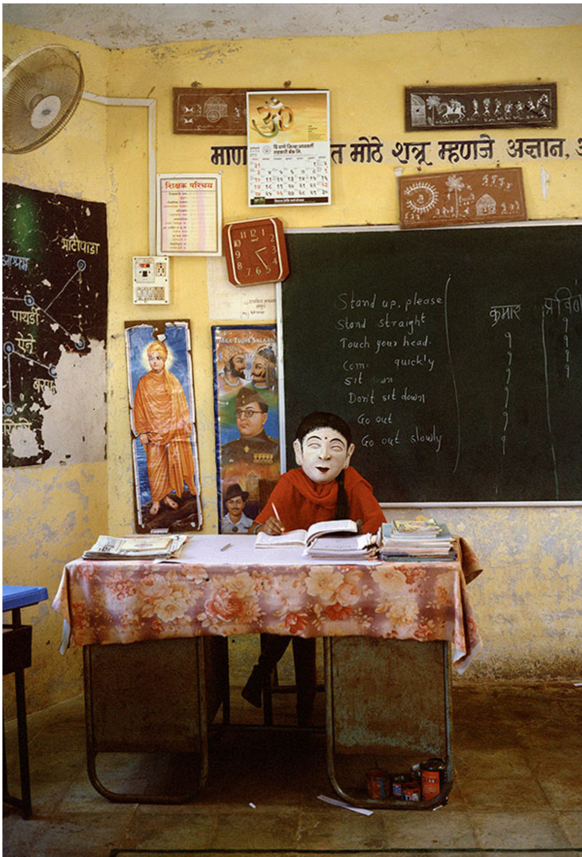
Gauri Gill, Untitled, from the series Acts of Appearance, 2015–ongoing